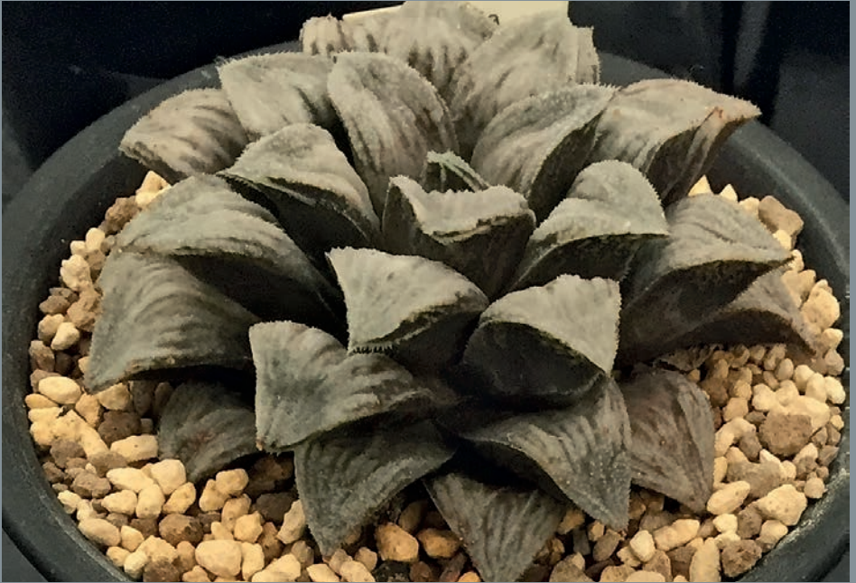
Haworthia cv. Ginsekai