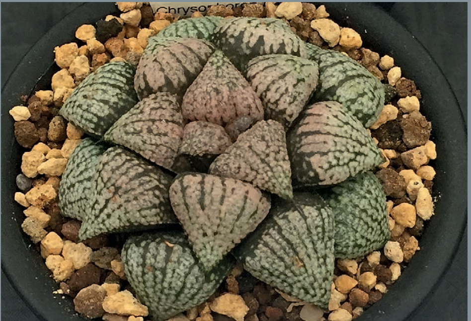
Haworthia picta cv. Chrysophoron